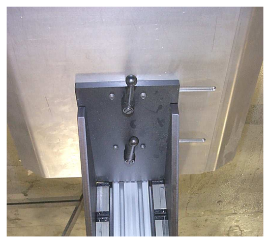
Figure 3.1 – Lower mouth adjusting handles

bottom mouth brackets and pulling the halves to the desired dimension. For the best results, ensure that each mouth half is an equal distance from the center line. The amount of