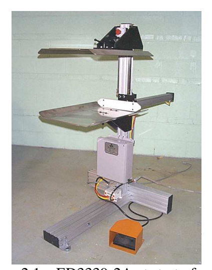
Figure 2.1 – ED3339-2A at start of cycle.

The machine is now ready for the air connection. When the air is turned on, the upper half of the mouth should move to its up position and the pusher plate should be fully retracted (see figure 2.1). Adjust the pressure regulator so that a pressure reading of 80-90 psi is visible on the gauge.