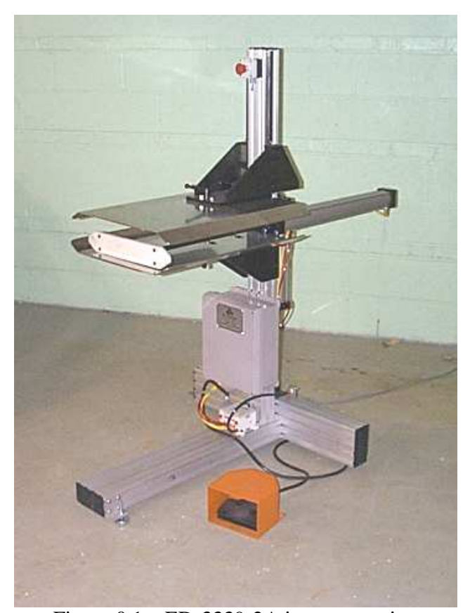
Figure 0.1 – ED-3339-2A in compression