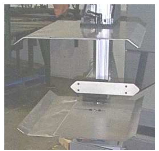
Figure 3.0 – Upper and lower stainless steel mouth.

The ED3339-2A is equipped with an adjustable stainless steel mouth (see figure 2.0). The upper and lower mouth halves are individually adjustable. The width of the mouths are adjusted by loosening the two (2) black handles (see figure 2.1) found on the top or