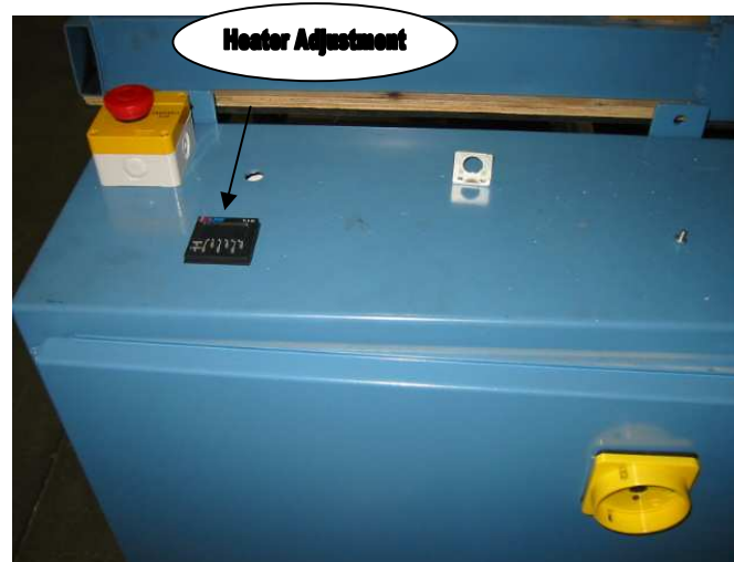
Figure 3.2 – E stop and Heater adjustment