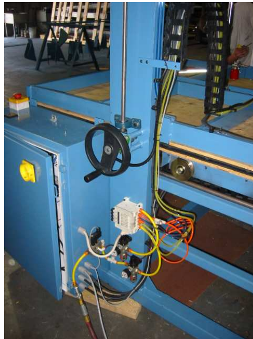
Figure 3.1 – Upper platen stroke adjustment handle.