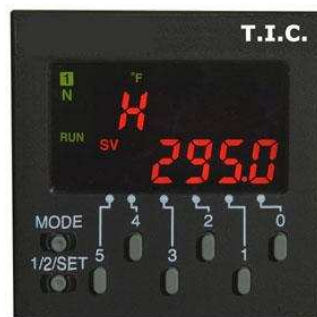
Figure 3.3 Temperature Controller

The temperature controller (Figure 3.3) is located on the top of the main cabinet adjacent to the E-stop button. All adjustments to the Heat Sealer are made from this display. The display can be cycled through its menu by pressing the mode button. There are five screens accessible by pressing the mode button; total number of cycles, heat seal temperature, heat seal time, cool down temperature, and heater bar current temperature. The steps below will guide you on how to adjust the various parameters.