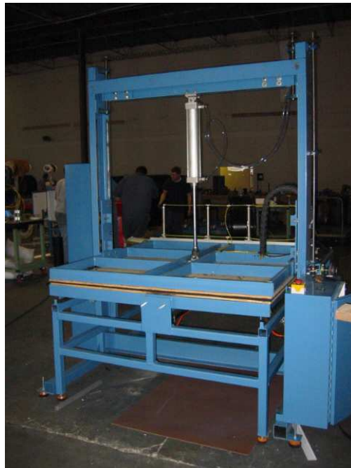
Figure 0.1 – ED-3339-2C in compression