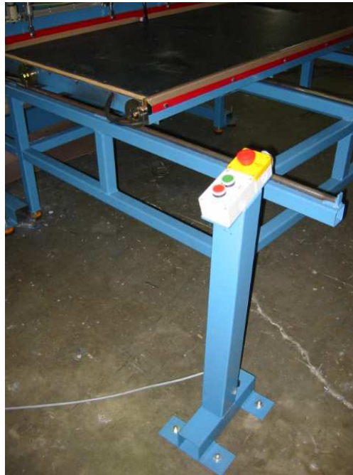
Figure 3.0 – Operator Start Station.

The ED3339-2C is equipped with an adjustable height UHMW platen (see figure 3.1). The upper mouth halve compression stroke is adjustable. The stroke can be adjusted by turning the hand wheel on the left side of the machine.