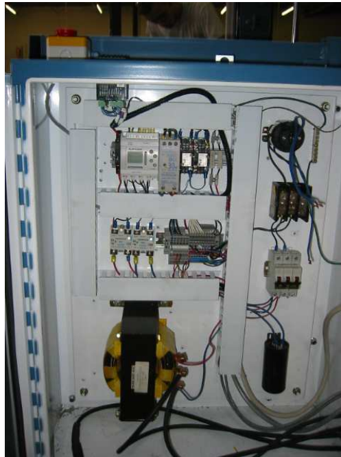
Figure 2.0 – Electrical Panel.

are as follows: Top row : PLC, 24VDC Power Supply, (2) Relays, Resistor - Middle Row : Solid State Relays Input/Output terminals - Bottom Row : 210-110 Volt Transformer – Vertical Column : Disconnect, Power Distribution Block, Circuit Breaker, Capacitor. With the power turned on, the 24Vdc power supply should have a green LED marked DC ON illuminated. If the green light is not on, check the main power connection and check that the main disconnect is on.