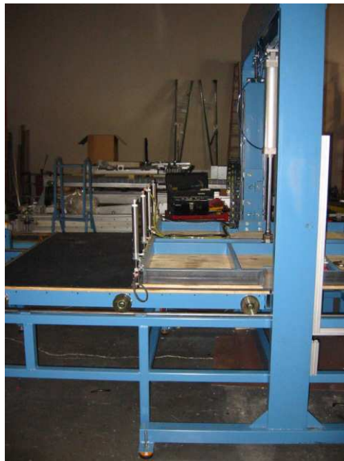
Figure 2.1 – ED3339-2A at start of cycle.

The machine is now ready for the air connection. When the air is turned on, the upper half of the mouth should move to its up position and the optional table should be fully extended (see figure 2.1). Adjust the pressure regulator so that a pressure reading of 80-90 psi is visible on the top gauge and 20-30 psi is visible on the lower gauge.