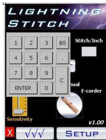
Figure 2.0 Keypad on main operator screen.

Directly to the right of the Bobbin % remaining value is the Stitch/Inch which stands for stitches per inch. Touching the value below the text brings up the keypad (see Figure 2.0). Any value between 3 and 22 may be entered. Touching the ENTER key will close the keypad and record the setting. Any value outside the range will be disregarded.