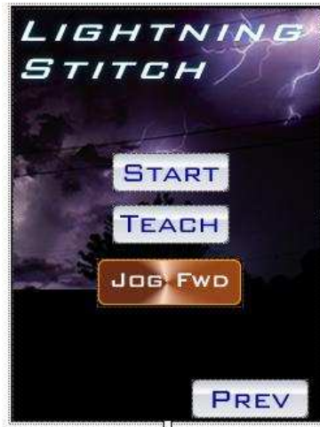
Figure 2.3 Home screen

The Lightning stitch control system operates off of the motors known position. As a result, the user may adjust the needle UP position electronically instead of mechanically as with other stitch regulators. To set the needle UP position, touch the START button on the home screen. Press the JOG FWD button to advance the needle to the desired position and then touch TEACH to set the value.