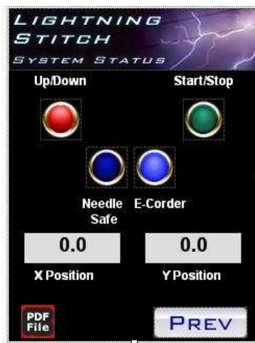
Figure 2.1 System status screen

The button directly to the right of the red X accesses the system status screen (see Figure 2.1). From this screen the user may confirm the correct functioning of the pushbuttons and the X and Y axis encoders. Pressing and holding the button will change the color of the specified lamp. Releasing the button will return the lamp back to its original color. Moving the machine left or right will change the value of the X position. Moving the machine forward or backward will change the value of the Y position.