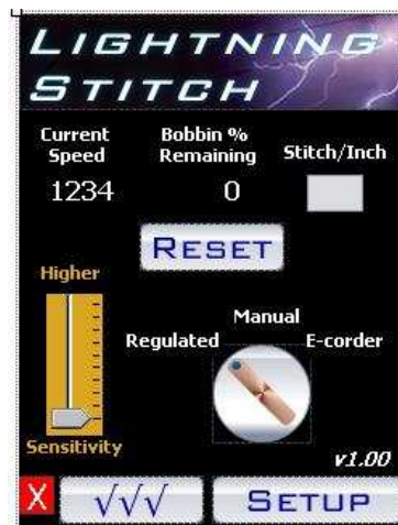
Figure 1.0 – Main operator screen

The operator interface provides the Innova user the ability to modify settings of the lightning stitch regulator as well as maintain and troubleshoot problems if needed. When the Innova is turned on, the Lightning Stitch controller and interface will take a few moments to boot – usually 30 seconds to 1 minute. The boot up procedure allows the controller to check that all components of the system are functioning properly. If problems are detected, the controller will notify the user through the operator interface. It is recommended that the machine be allowed to boot up completely before attempting to operate the machine. This will ensure that all components function properly. Upon completion of a successful boot up, the main operator screen will be displayed (see Figure 1.0).