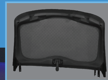
GM - Corvette Y1BC Quilted Headliner

It can quilt leather and vinyl backed by high density poly foam material up to 5/8" thick.